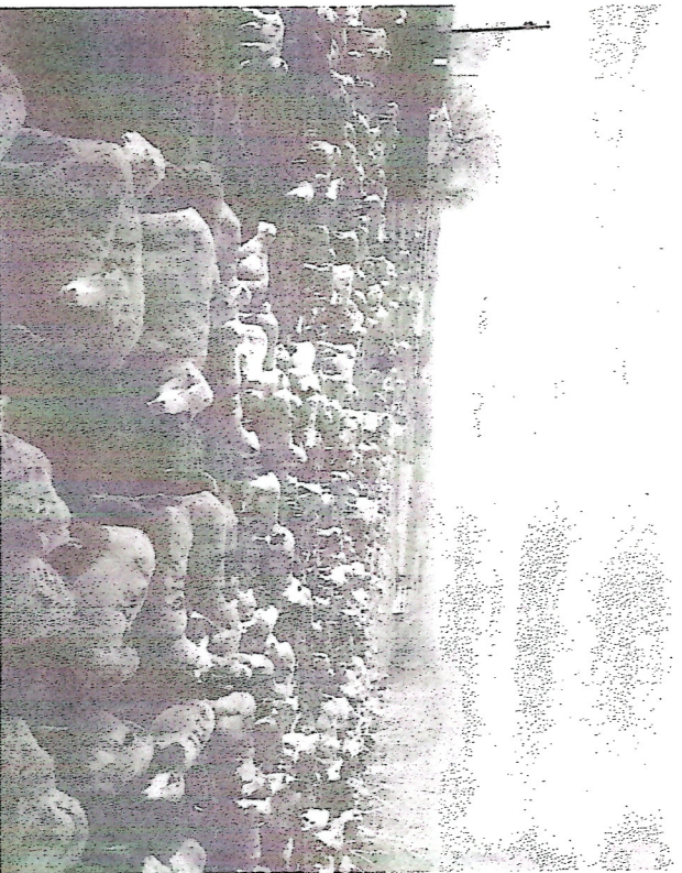
Our flock of ewes with lambs.

You see, I had been raised in town and knew nothing about ranching or taking care of animals and I will admit to this day that I am afraid of cows and horses. I swear there were