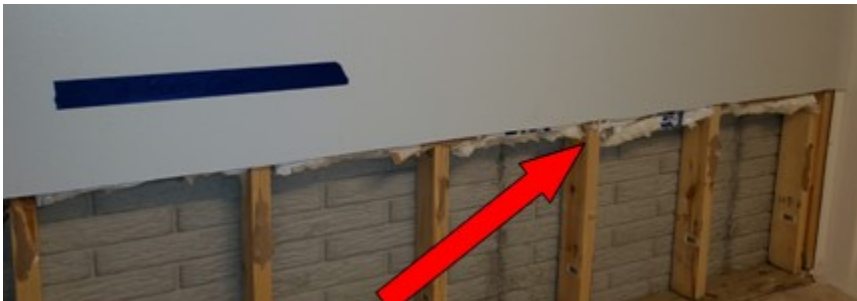
Insulation showing. I don't see a line item for insulation. Please advise.